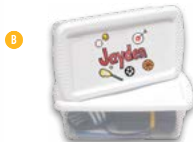
Hand Painted Personalization Options